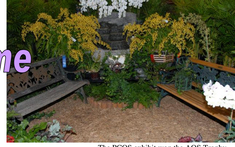
The PCOS exhibit won the AOS Trophy.